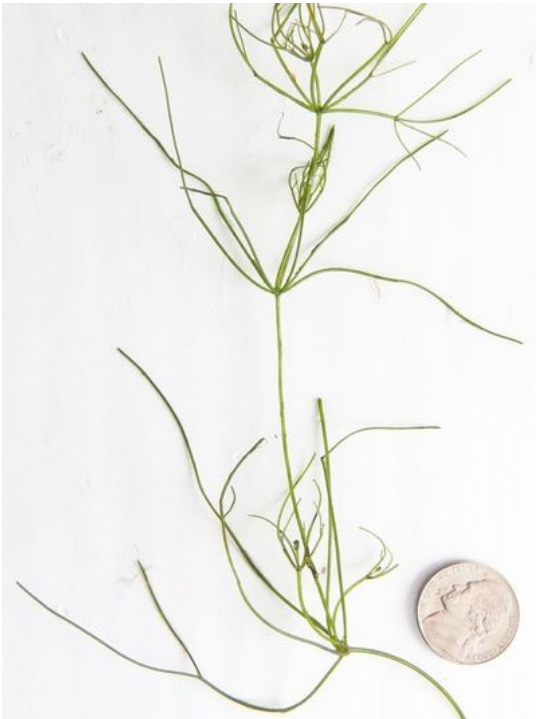
Nitellopsis obtusa or Starry Stonewort